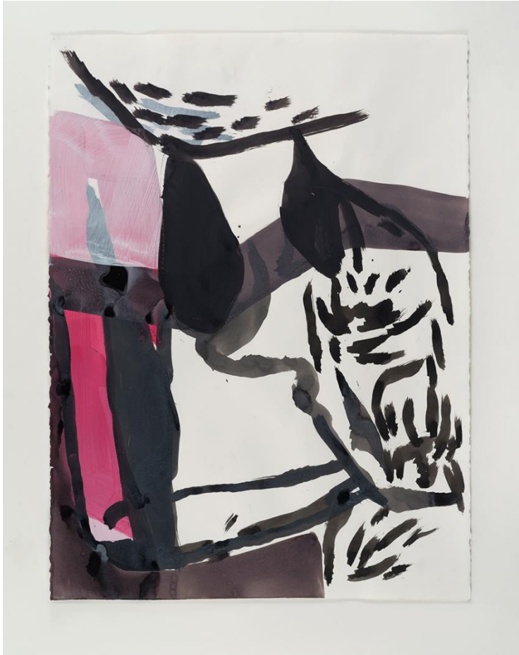
Amy Sillman, Pink Drawings , 2015-16, acrylic, charcoal, and ink on paper, 40 drawings 76 x 57 cm each.

Sillman's process has an internal momentum that won't be quelled until it's had the last word. 'Landline', her first UK institutional show, steams through Camden Arts Centre: as if dossiers have been shaken loose, then stuffed back into a briefcase, her language is unpacked across extended sequences of works on paper, then compressed in the impacted, waxy surface of her canvases. In talks, the artist often shares photo-diaries of her paintings' journey – in toggling through, she lends patches of colour a living character. At Camden, too, shapes palpably expand, gobble up extraneous segments, elbow their way round the room. After all, contemporary painting is an unspooling, living thing; work is glimpsed unfinished on studio visits, 'WIPs' with enough optical game are dispatched to Instagram.